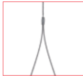
Y-Fit No.2 YHF2