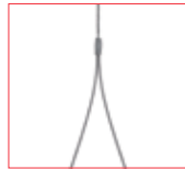
Y-Fit No.3 YHF3