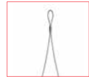
Y-Fit Accessory No.3 AY3